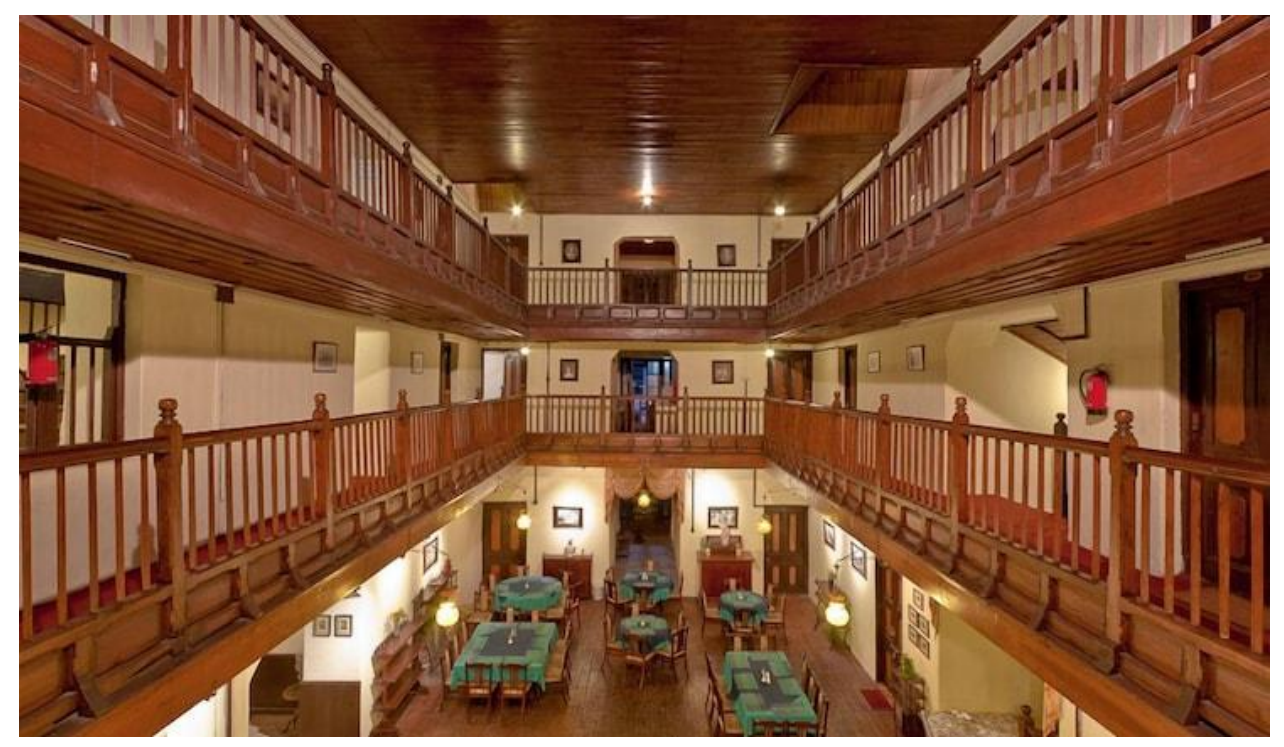
INTERIOR VIEW FROM FIRST FLOOR