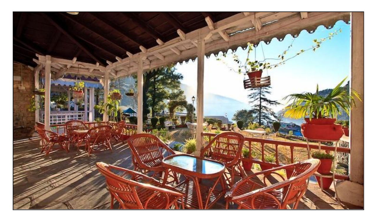
BALCONY FROM GROUND FLOOR